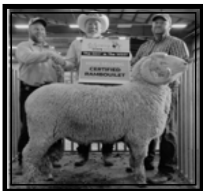
Lot 4-High Selling Certified Rambouillet from Erk Brothers sold for $2600 Purchased by Schmidt Ranch